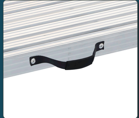
3 Durable Handle For easy transportation