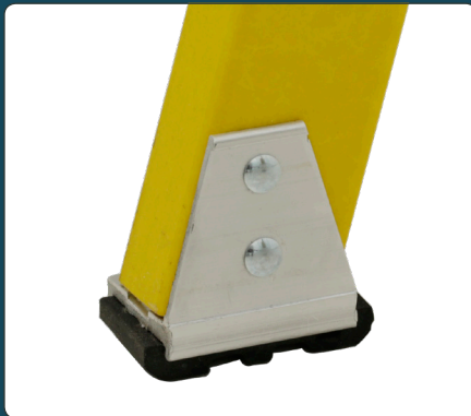
4 Slip-resistant Rubber feet