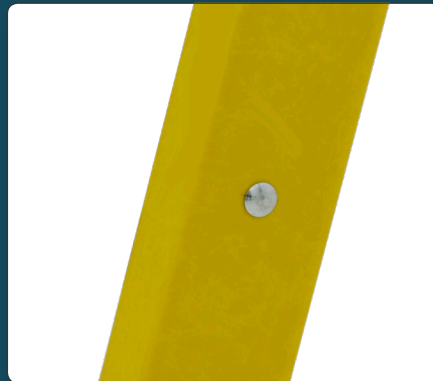
5 Rails Durable non-conductive fiberglass