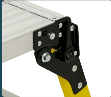
2 Locking Hinges Create stability and allow the platform to fold and be stored