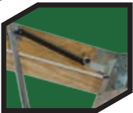
ADVANCED CYLINDER DESIGN