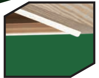
WEATHER STRIPPING SEAL REDUCES AIR LEAKAGE