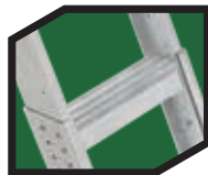
SLIP-RESISTANT CROSS TREAD STEP