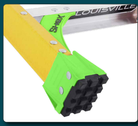
④ Raptor Boot and SHOX<sup>™</sup>

Heavy-duty interior support braces protect the ladder during transport to extend its lifespan.