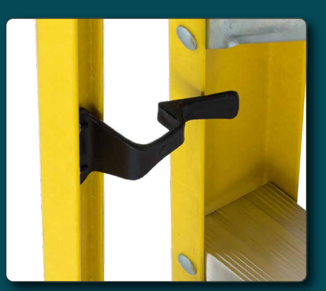
2 Locking Latch to secure rear section.