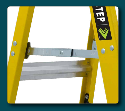
Inside Spreader Brace

Heavy-duty interior support braces protect the ladder during transport to extend its lifespan.