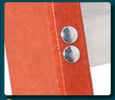
3 Double-Rivet Step Construction