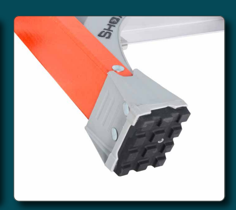
5 Raptor Boot™

Advanced impact absorbtion system offers superior protection against damage.