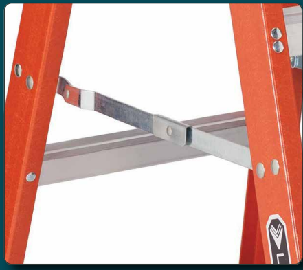
2 Spreader Braces