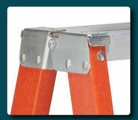
1 Heavy-Gauge Steel Hinges