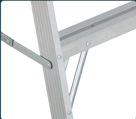
4 Heavy Duty Gusset Heavy-duty gusset on every step for increased rigidity and support