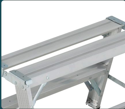
1 Heavy Duty Top 10-in deep top with slip-resistant tread