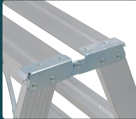
2 Steel Hinges Heavy-gauge steel hinges