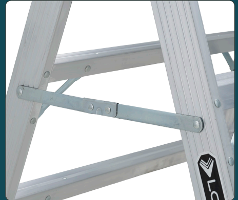
3 Spreader Brace Heavy duty pinch-resistant spreader braces