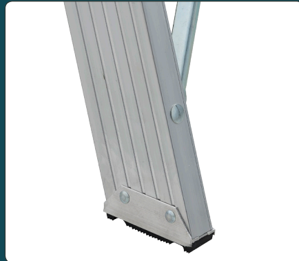
5 Aluminum Shoe Slip-resistant rubber tread with heavy duty aluminum shoe