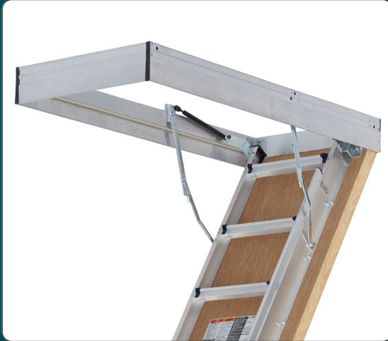
1 Lighter Aluminum Frame Pre-drilled holes for easier installation.