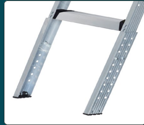
5 Adjustable Shoes Fits heights 7-ft 8 in to 10-ft 3-in.