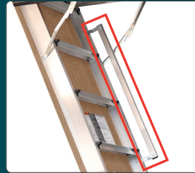
6 Safety Aluminum handrail for a comfortable transition.