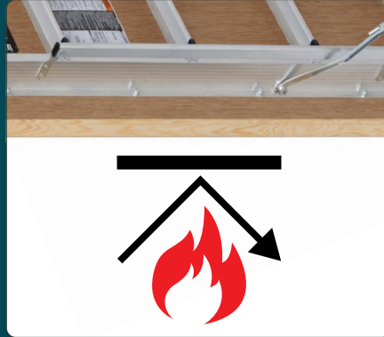
2 Fire Rated Door Flame retardant time of 30 minutes compliant with ASTM E-84