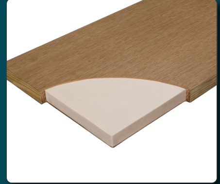
3 Superior Energy Efficiency R10 insulated door with weather stripping that reduces energy loss.