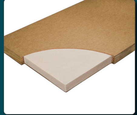
3 Superior Energy Efficiency R10 insulated door with weather stripping that reduces energy loss.