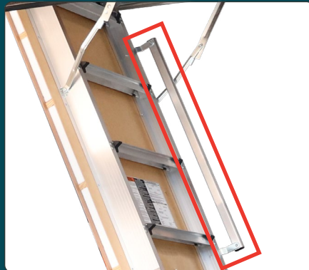
5 Safety Aluminum handrail for a comfortable transition.