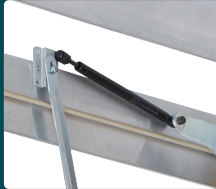
2 Smooth Operation Easier to open and close. Door with gas piston system.