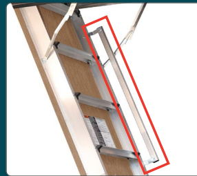
6 Safety Double aluminum handrail for a comfortable transition.