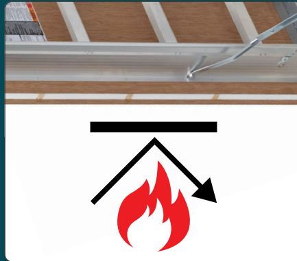
2 Fire Rated Door Flame retardant time of 30 minutes compliant with ASTM E-84