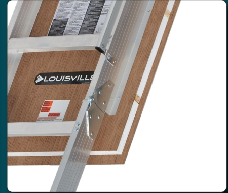
3 Superior Energy Efficiency R5 insulated door with weather stripping that reduces energy loss.