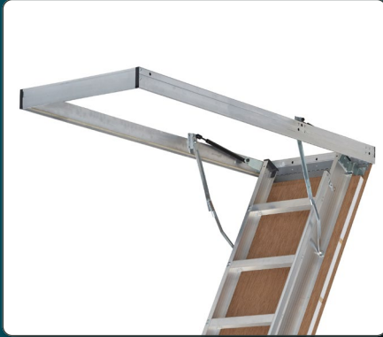
1 Lighter Aluminum Frame Pre-drilled holes for easier installation.