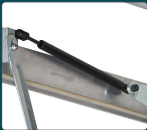
4 Smooth Operation Easier to open and close. Door with gas piston system.