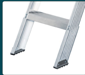
5 Adjustable Shoes Fits heights 10-ft to 12-ft.