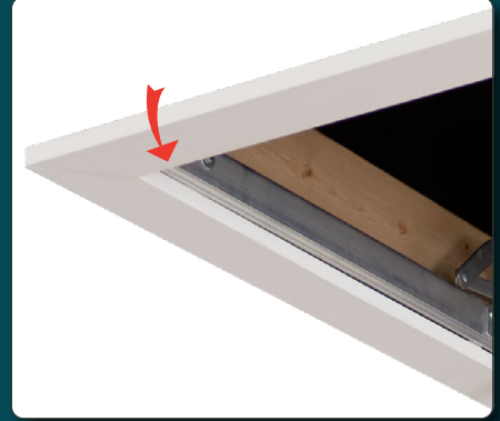
3 Energy Efficiency Weather stripping that reduces energy loss.