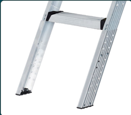
4 Adjustable Shoes Fits heights 7-ft 8 in to 10-ft 3-in.