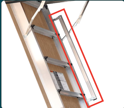
5 Safety Aluminum handrail for a comfortable transition.