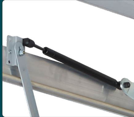
2 Smooth Operation Easier to open and close. Door with gas piston system.