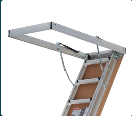
1 Lighter Aluminum Frame Pre-drilled holes for easier installation.